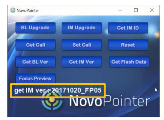
The update is now completed!